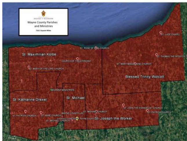
Roman Catholic Diocese of Rochester Office of Pastoral Resources and Planning

Please be sure and watch our parish bulletin for more information. Your input is important! Also important are your prayers. Throughout this process we ask that you pray that we be led by the Holy Spirit to develop a plan that is in accord with God’s will. Please pray that our focus be not just on numbers but on the people we serve and the gifts and strengths each parish has to offer.