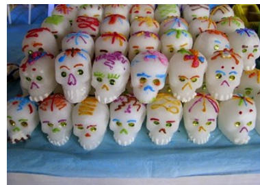
Panes de los muertos

Estas calaveritas de azúcar son símbolos de que no debe temerse a la muerte.